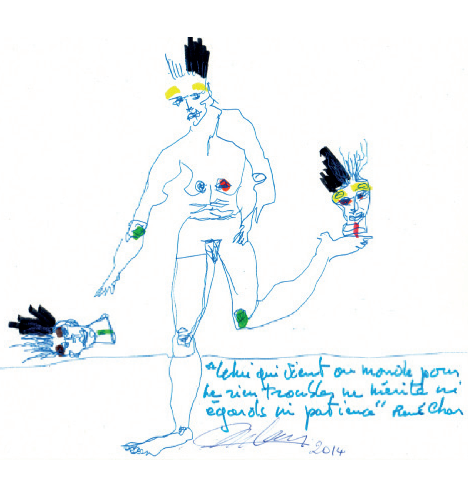
«The one who comes into the world to disturb nothing deserves neither consideration nor patience» René Char